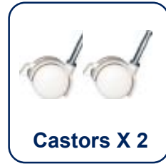
Castors X 2