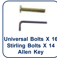
Universal Bolts X 16 Stirling Bolts X 14 Allen Key