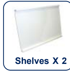
Shelves X 2